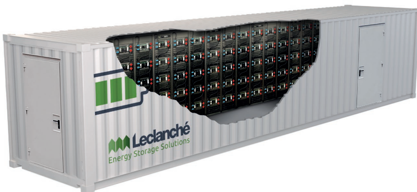
All in one containerized solution