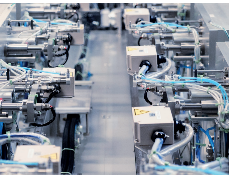
Cell production facility

The heart of any storage system is the cell. Its quality determines the performance of the entire storage system. Leclanché's Li-ion G/NMC pouch cells are made of the highest quality materials, using unique, state-of-the-art processes to maximise safety and cycle life.