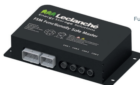
Functionally Safe BMS Master